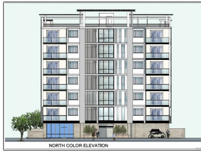
NORTH COLOR ELEVATION